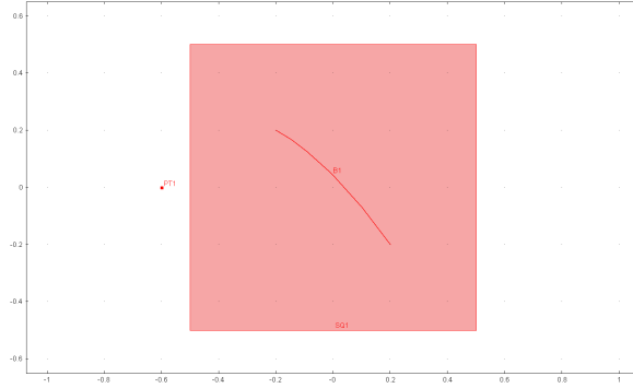
Figure 0-1: Geometry.

The geometry consists of a quadratic dielectric domain. Inside the domain we have a curve representing an electrode with a fixed charge, Q_{ref} .